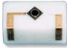
PD100-003-0xx Ceramic Sub-Mount