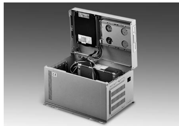
Easy access to internal components