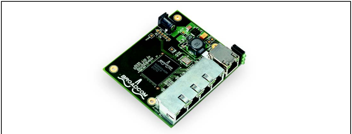
Low Cost Five-Port 10/100 Stand-alone Switch