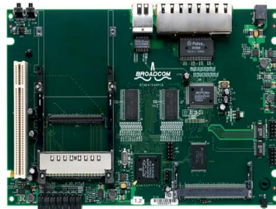
AP/Router Reference Design