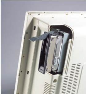
Removable 3.5" HDD bay

Touchscreen Options Customers can choose from three optional types of standardized touchscreens: resistive, capacitive and SAW (Surface Acoustic Wave). These options make the PPC-174T a more user-friendly interface for different environments.