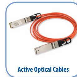
Active Optical Cables