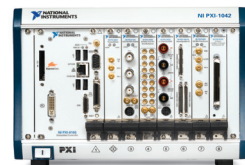
Figure 1. This NI PXIe-8106 controls an 8-slot PXI Express modular instrument and data acquisition system.

NI 8106 embedded controllers deliver a performance improvement of up to 100 percent compared to systems and instruments running traditional single-core processors and up to 46 percent for LabVIEW applications compared to the NI 8105 embedded controllers and other systems using an Intel Core Duo processor, Intel's previous-generation dual-core architecture. Using SYSmark benchmarking software, NI 8106 controllers demonstrate an overall performance improvement of 29 percent compared to NI 8105 controllers.