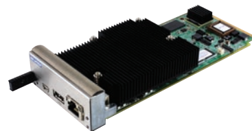
Figure 1: MIC-5602A2-M2E with Full-Size Front Panel