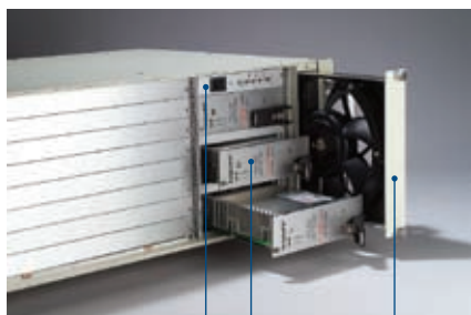
LED board Hot-swappable 193-CFM fan module AC cPCI 500 W + 250 W redundant (2+1) power supplies