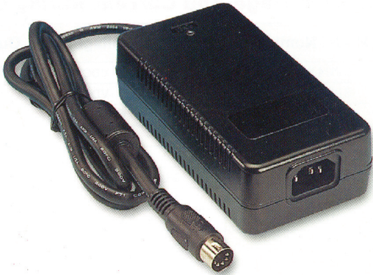
5.75" x 3" x 1.7"