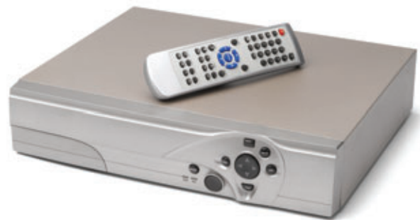
Example Application: DVR