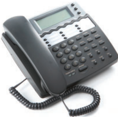
Example Application: IP Phone

The 88E1121R can operate with just two voltages, 1.2V for the core and 1.8V/2.5V/3.3V for I/O. It consumes only 700 mW per port and features energy detect and energy detect+™ low-power modes. It supports data terminal equipment (DTE) power function for Power over Ethernet (PoE) applications. The device also incorporates the advanced Marvell Virtual Cable Tester® (advanced Marvell VCT™) feature for remote identification of potential cable malfunctions, thus reducing equipment returns and service calls. Housed in a 100-pin TQFP package and measuring only 16mm x 16mm on each side, the 88E1121R is the smallest dual-port Gigabit Ethernet PHY on the market.