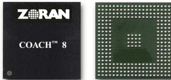
17mm x 17mm