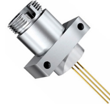
PD300-003-5xx FC Receptacle