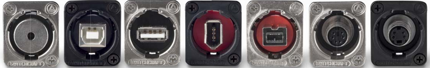
EH35MMMSC EHUSBBAB EHUSBAB EHFWX2B EHF800X2 EH6MD2 EHSVHS2B