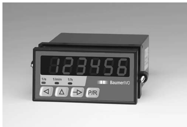
TA200 - LED-Tachometer