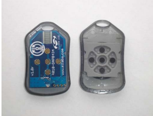
Figure 1. 4010 RKE Universal Key Fob and Plastic Case (P/N 4010-DAPB_434 and MSC-PLPB_1)