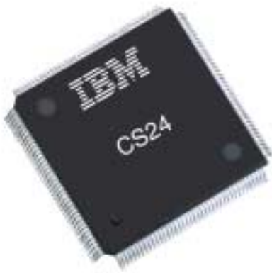
Figure 1: IBM's single-chip digital audio/video decoders integrate advanced features for high-performance solutions.