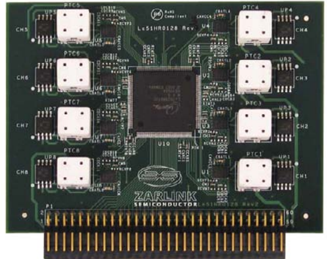
Le51HR0128 VCP Octal ISLAC Line Module

Our VoicePath™ Application Programming Interface II (VP API-II) provides a standard software interface for controlling, supervising, and performing line testing using VE792 NGCC voice termination devices.