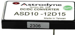
Unit measures 1"W x 2"L x 0.25"H