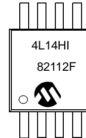
8-Lead 2x3 TDFN