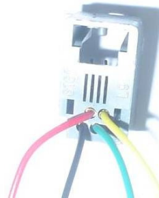
Figure 2.2 Handset wire connection to the standard 616E jack.