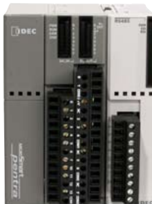
FC5A PLC Slim Type CPU