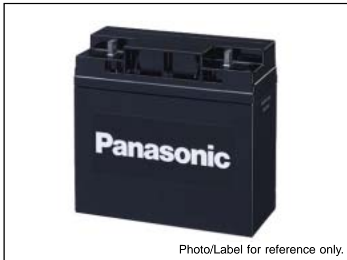
(a) The photo and dimensions represent LC-X1220P.