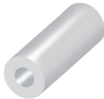
R30-500 Brass, Circular M3, Ø4.76mm O/D