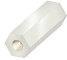
R30-161 Plastic, Hexagonal M3, 5.5mm A/F