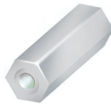
R30-101 Brass, Hexagonal M3, 5.5mm A/F