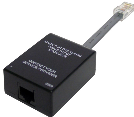
Z-BLOCKER® Z-A431PJ31X-A Alarm Panel DSL Filter