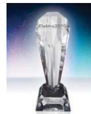
Elektra Award 2010