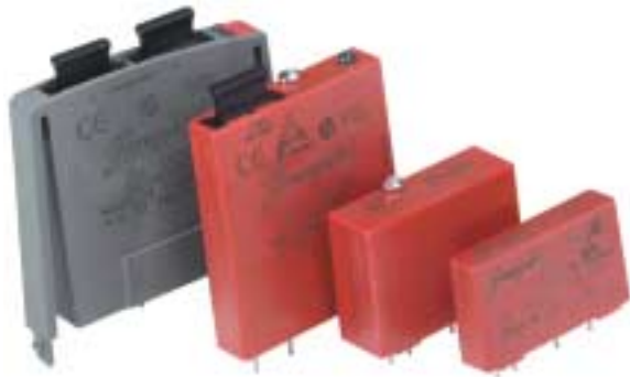
70L-ODC 70G-ODC 70-ODC 70M-ODC