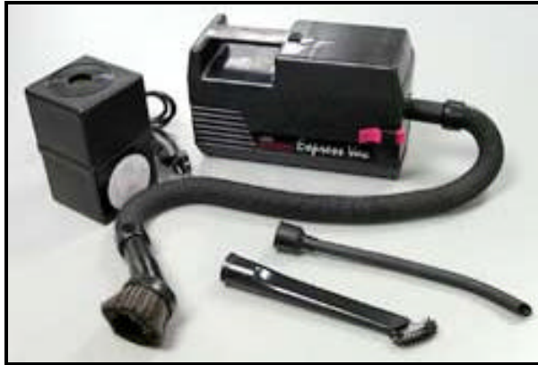
EXPRESS CARTRIDGE VACUUM

POWERFUL. Atrix has built in a new, powerful motor making the Express Plus as powerful as most of the larger service vacuums.