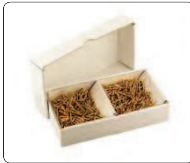
1000 pcs bulk packing