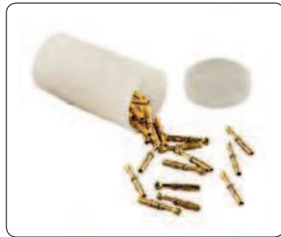
50 pcs bulk packing (standard)