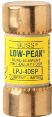
LPJ-5SP Class J, Dual-Element, Time Delay