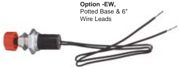
Option -EW, Potted Base & 6" Wire Leads