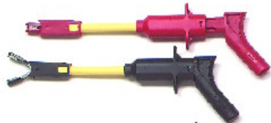
Model 5912A : Alligator Clip Maxigrabbers