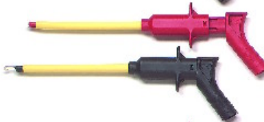
Model 5911A : Hook Tip Maxigrabbers