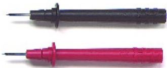
Model 6232 : Test Probes