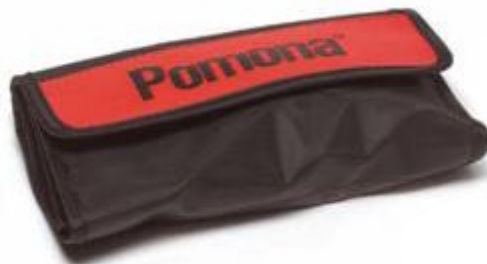
Model 5955 : Ttri-fold nylon pouch

Visit www.pomonaelectronics.com for complete specifications on individual Pomona models.