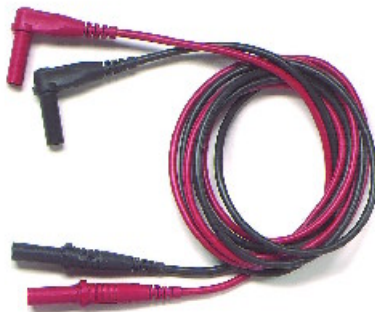
Model 5907A : Straight to Right Angle Banana Plug Test Leads