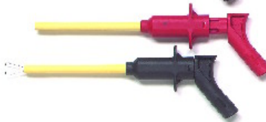
Model 5910A : Pincer Tip Maxigrabbers