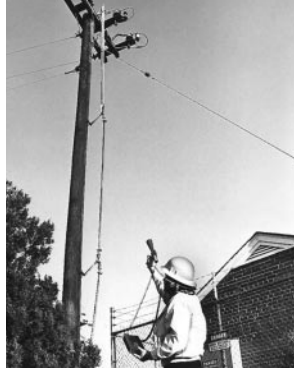
The detector is excellent for patrolling pole lines.