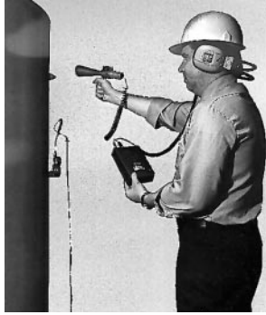
Locating a leak in an air pressure tank