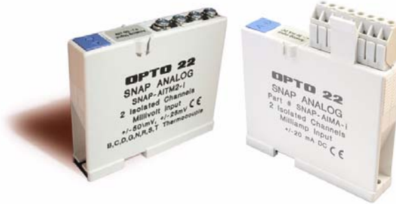
SNAP Isolated Analog Input Modules

Transformer isolation prevents ground loop currents from flowing between field devices and causing noise that produces erroneous readings. Ground loop currents are caused when two grounded field devices share a connection, and the ground potential at each device is different. Optical isolation provides 4,000 volts of transient