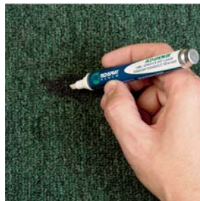
Ink removal from carpet