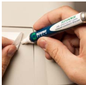
Label & adhesive removal