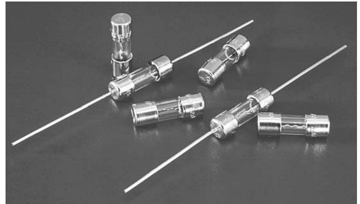
225 000P Series

Contact Littelfuse concerning other ampere ratings.