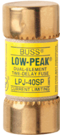
LPJ-6SP Class J, Dual-Element, Time Delay