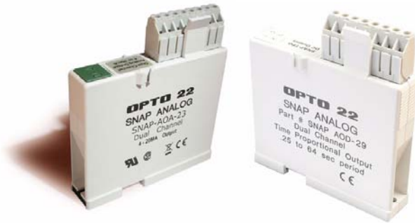
SNAP Analog Output Modules

Transformer isolation prevents ground loop currents from flowing between field devices and causing noise that produces erroneous readings. Ground loop currents are caused when two grounded