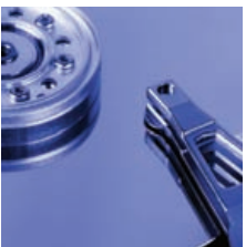
Critical Electronics & Surfaces