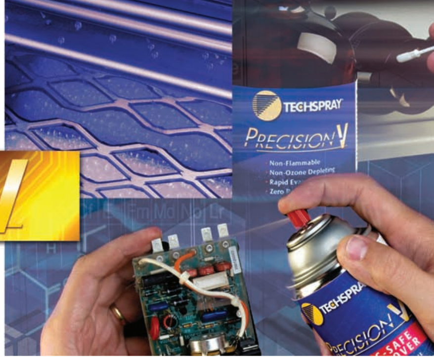
Precision-V formulas available for vapor-degreasing, cold cleaning and aerosol.

Techspray has engineered solvent cleaners that offer exciting new options for precision cleaning. Precision-V cleaners are powerful, leave no residue, and evaporate extremely fast. Electronics, optics, and metal parts are quickly and thoroughly cleaned, eliminating the need for further rinsing.