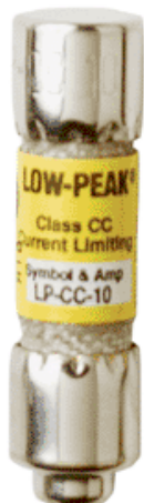
LP-CC-7 Class CC, Time Delay Fuse