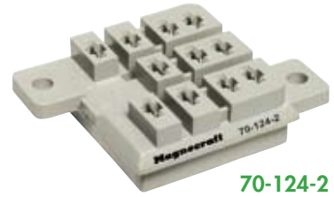
70-124-2 Quick Connect Terminals