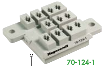
70-124-1 Solder Terminals