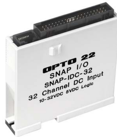
SNAP-IDC-32 high-density digital input module

All HDD input modules feature automatic counting and latching. The DC models are ideal for detecting low-voltage auxiliary contacts.