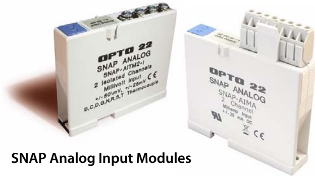
SNAP Analog Input Modules

IMPORTANT: Any system using analog sensors and input modules should be calibrated annually for analog signals. For I/O units on a SNAP PAC System, use the PAC Control™ commands "Calculate and Set Offset" and "Calculate and Set Gain." For other Ethernet-based I/O units, you can also use PAC Manager™ software to calculate and set offset and gain.