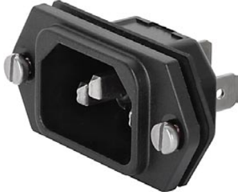
6100 with sealing to appliance