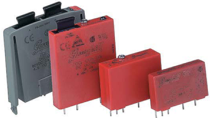
70L-ODC5R 70G-ODCR/OACRLY 70-ODCR/OACRLY 70M-ODCR