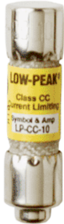
LP-CC-6 Class CC, Time Delay Fuse