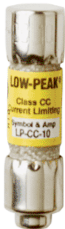
LP-CC-15 Class CC, Time Delay Fuse