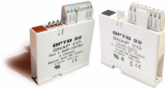
SNAP Digital Output Modules