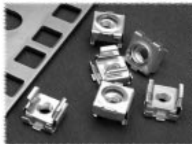
Additional Cage Nuts