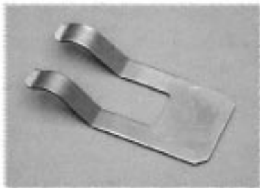
Cage Nut Installation Tool