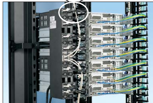
Complete POU Solution